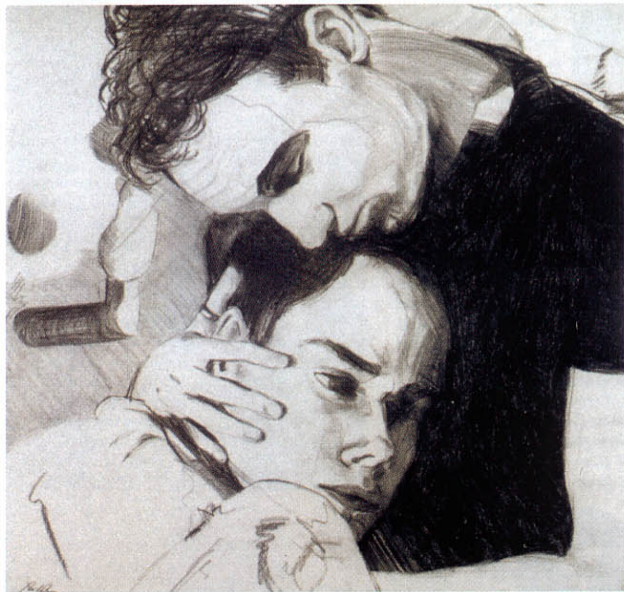
RUNNING OUT OF REASONS