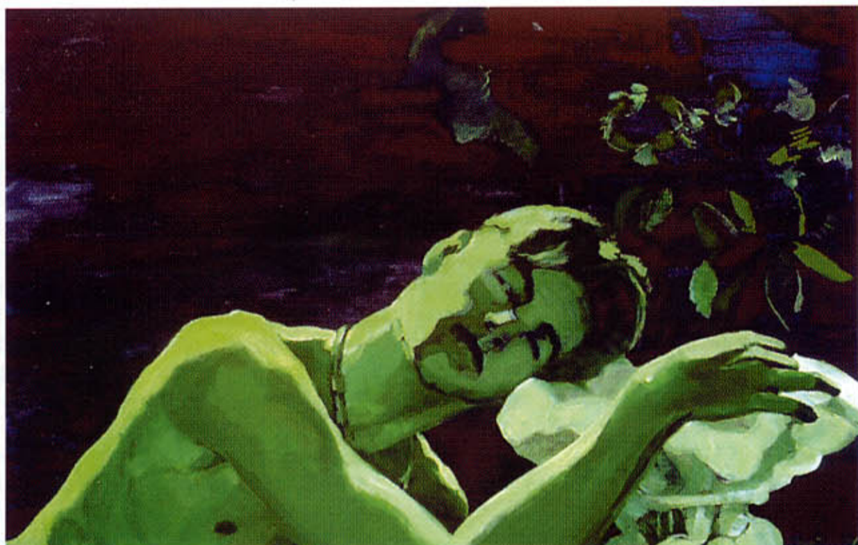
v LEFT IN THE GARDEN